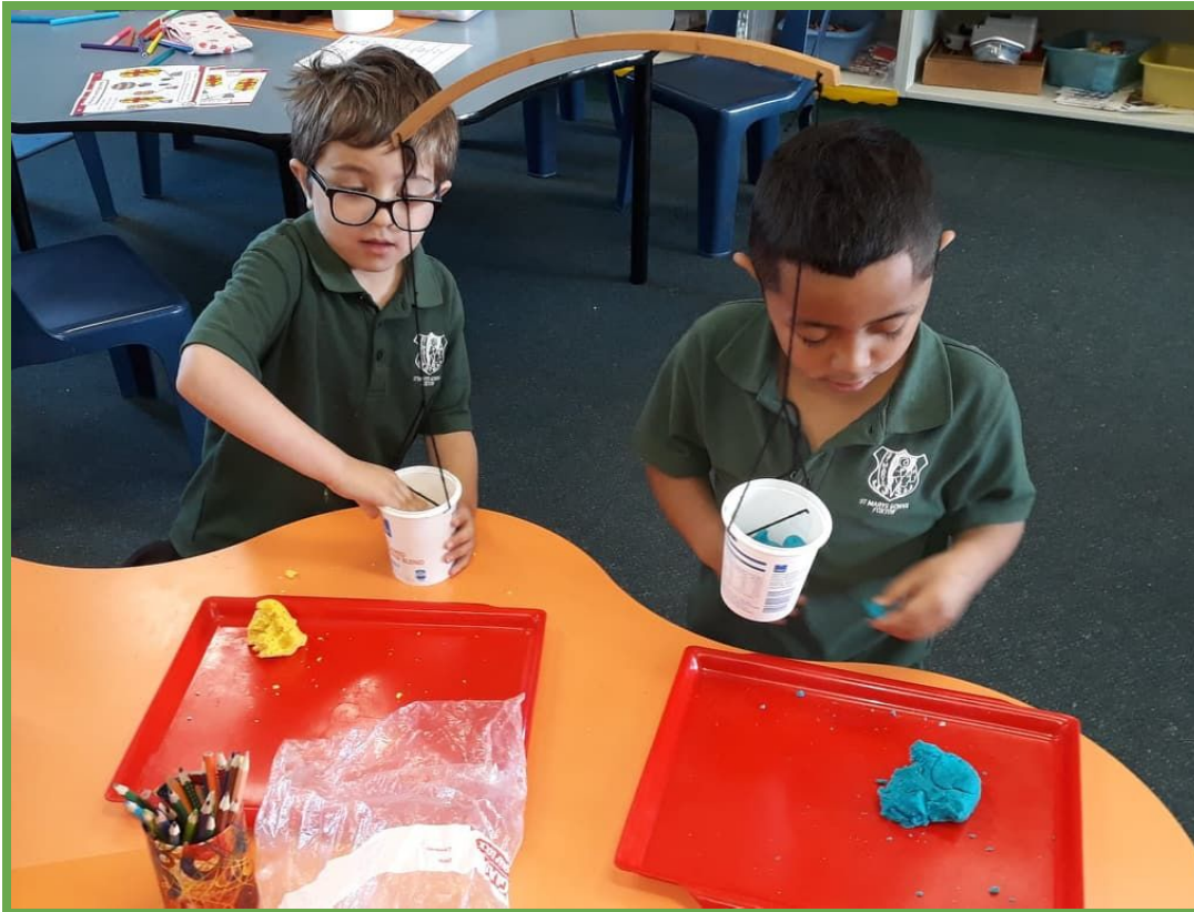
It's all about measurement in Room 3